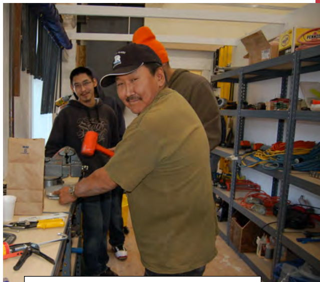
Students working in the new tool room

Come by our office or check our website for more information!