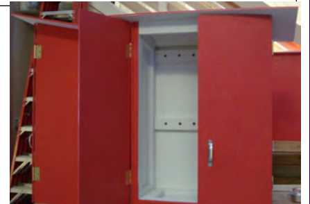
Life-vest storage built by students