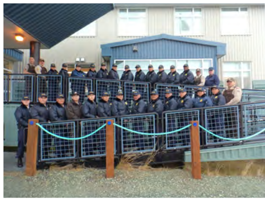
Pictured above is the graduating class of Village Police Officer (VPO)/Tribal Police Officer (TPO) Training #27. Twenty five participants from all over Alaska attended and completed the training program.