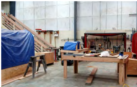
Above: Students from KLA are able to use the Yuut Elitnaurviat shop for Construction Trades training.