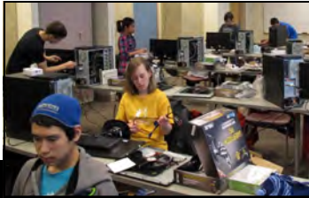
Above: Interspersing loading software with eating pizza, students in the Spring 2012 ANSEP Computer Build work on constructing the computers that they get to keep if they complete the entire program.

The spring 2012 ANSEP computer build was a success! 17 students from various villages and Bethel Regional High School came to Yuut Elitnaurviat to learn how to build a working computer from the ground up.