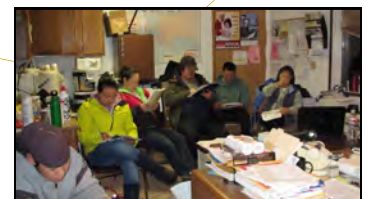
Below: Students taking the DMV Knowledge test in Platinum, AK.