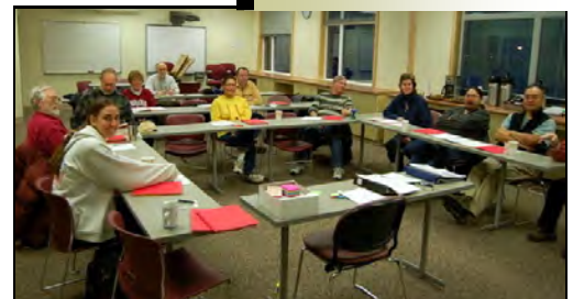
Below: The newly hired ABE facilitators come to Bethel to see Yuut Elitnaurviat, meet the Bethel ABE staff, get some training, and eat some great food at the Yuut Elitnaurviat cafeteria.