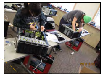
Above: Students work to assemble their computers.