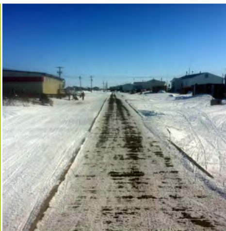
Left: Kotlik, Alaska in mid-April, 2013. The Career Guides travel to as many villages in the Yukon-Kuskokwim Delta as they can to deliver Career Guide services and the Driver Permit class.