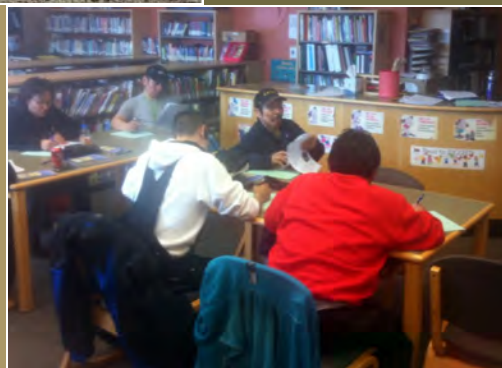
Right: Students from the Driver Permit class in Kotlik, Alaska taking practice tests in preparation for the state exam.