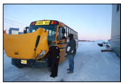
Above: A Class B School Bus CDL applicant performs the pre-trip inspection portion of the CDL Skills Test under the eye of an examiner.

year. The length and cost of the course is still to be determined, will tentatively be in the 4-6 week range. The course will include classroom instruction, hands on training, and behind the wheel experience.