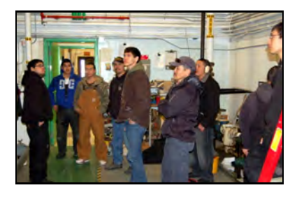
Above: Students in CTT 135: Boiler Troubleshooting and Boiler Repair get to take field trips around Bethel to see commercial boiler rooms.

The students began in January with Construction Technology Core during the day and Construction Math in the evenings. In February they moved