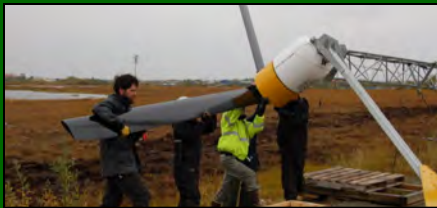
Above: Workers with Bering Straits Development Company out of Nome tightening the blades on Wind Turbine #2.

We were able to install the alternative energy systems on campus as a result of a capital projects grant from the US Department of Education, Alaska Native Education. YE designed the current system after working with the Cold Climate