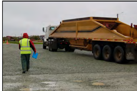
Above: The Yuut Driving Academy is offering Commercial Driver License Road Skills Testing which will not be available at the Bethel Department of Motor Vehicles (DMV) until the Spring of 2013.