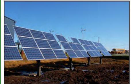
Above: The Yuut Elitnaurviat Five Stand Solar Array with two of the wind turbines visible in the background.