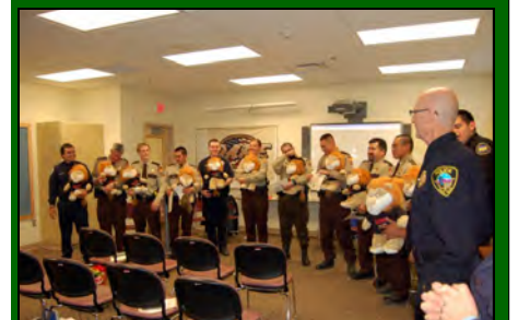
Above: Members of the D.A.R.E. Officer Training Class of August 6-17 pose for pictures with their instructors, and their Daren the Lion stuffed animals. The training includes solo presentations before groups of children at local schools.