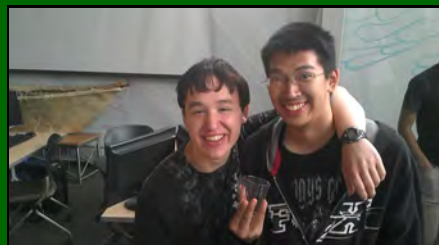
Above: RANSEP students don't just gain collegiate success skills while in Bethel, they also form friendships with fellow students and host families.